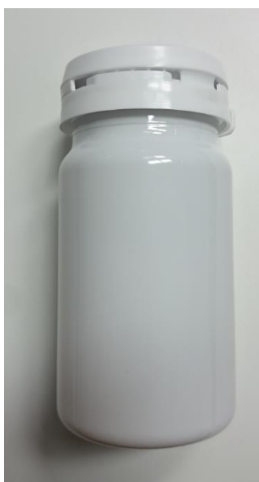
Picture 1. Photo of the tested product